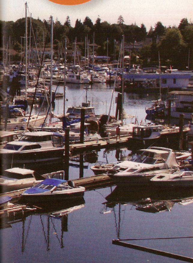
Above: Smitty's Marina - crammed with yachts

Molly's Reach restaurant was the film set for the Beachcombers TV show