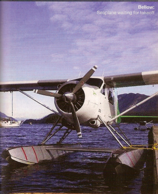
Below: Seaplane waiting for takeoff

restaurant that provided part of the film set for the popular Beachcombers TV series that ran from 1972 - 1990.