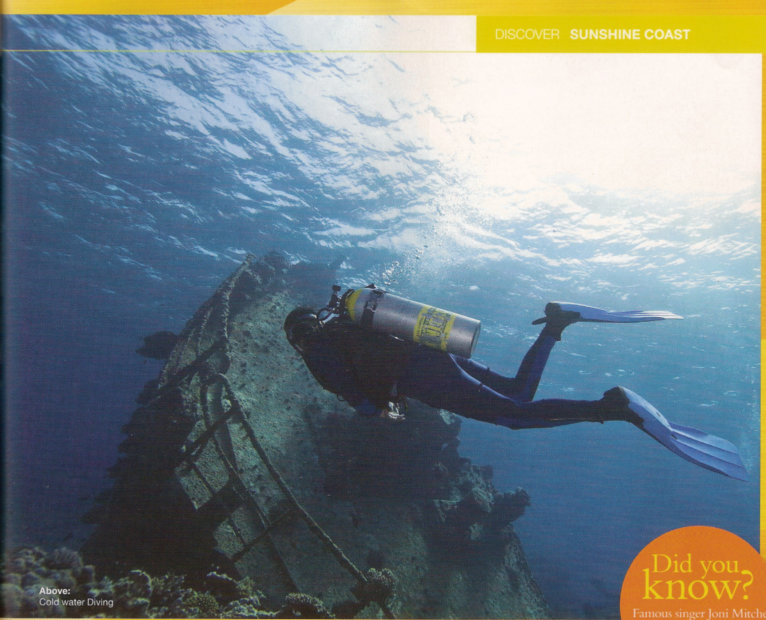
Above: Cold water Diving